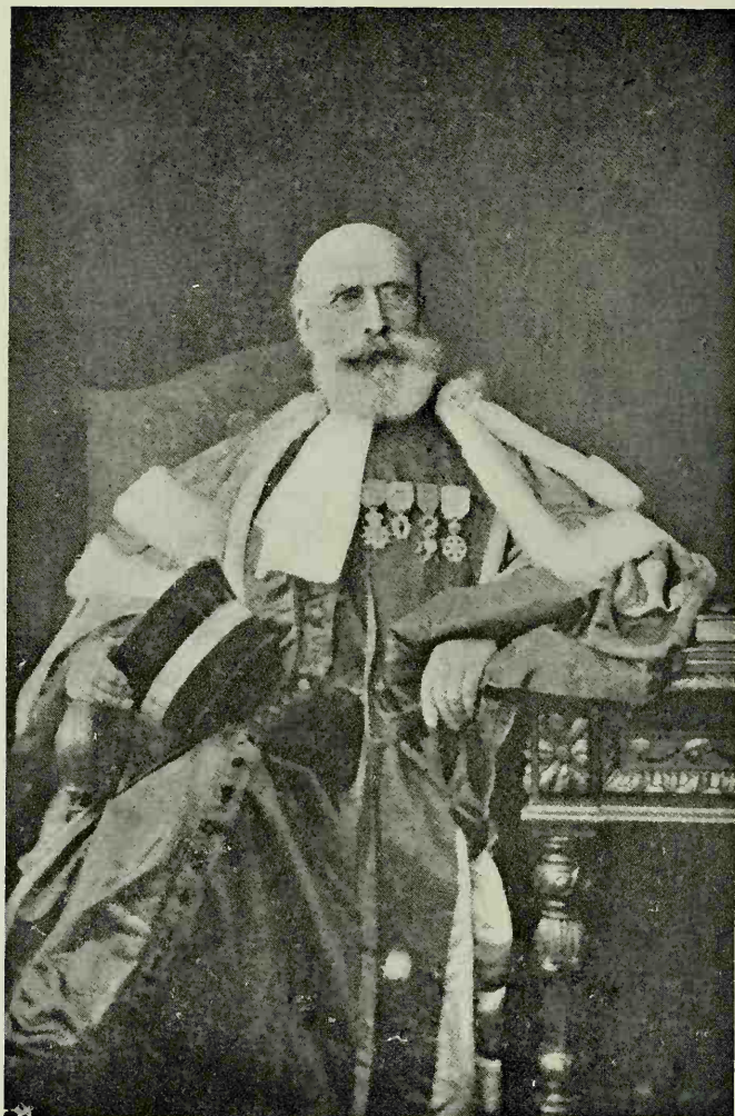
PIERRE JACQUES ANTOINE BÉCHAMP when Professor of Medical Chemistry and Pharmacy at the University of Montpellier 1857-1875