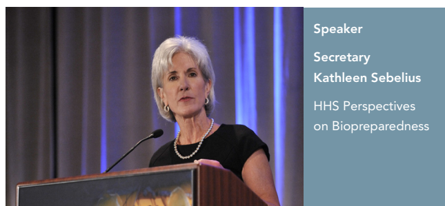
Speaker Secretary Kathleen Sebelius HHS Perspectives on Biopreparedness

Fortunately, with a greater understanding of the threat posed by biological agents, leaders in the U.S. government and in the private sector are working to build national response capacity and resilience.