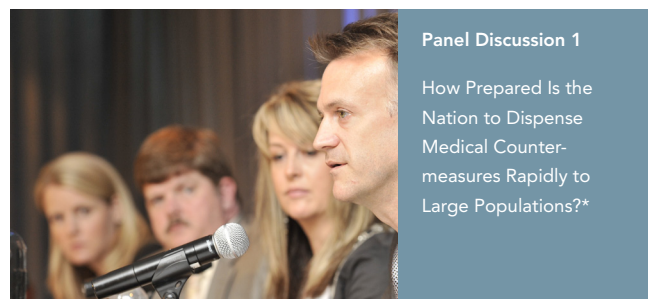
Panel Discussion 1 How Prepared Is the Nation to Dispense Medical Counter- measures Rapidly to Large Populations?*

Secretary Sebelius underscored the need to strengthen the nation's public health infrastructure, which undergirds U.S. response to disasters. She made reference to a recent CDC report on performance of the Public Health Emergency Preparedness cooperative agreement program, which demonstrated that the economic downturn and reductions in preparedness funding may be hindering gains in preparedness at the state and local levels.