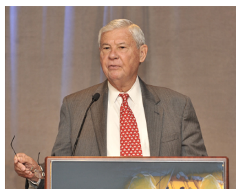
Speaker Senator Robert Graham Senator Bob Graham, Chairman, WMD Commission; Co-Founder, The WMD Center

The state of biopreparedness in the U.S. is improving, but many important challenges remain. Since 2001, federal, state, and local governments and their private sector and NGO partners have collaborated across disciplines to cultivate working relationships and