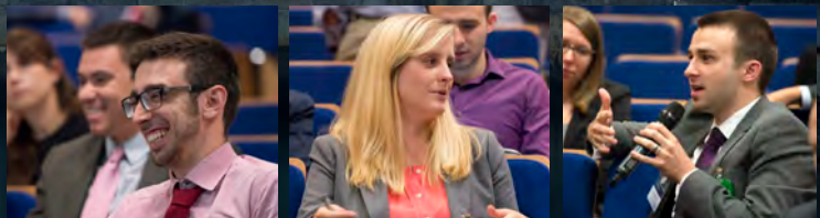
Emerging Leaders in Biosecurity Class of 2015